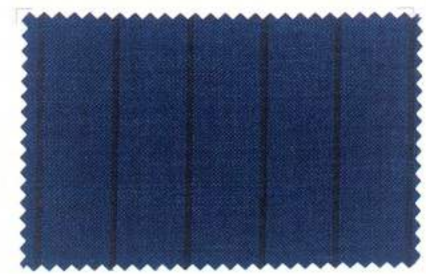
621 - 088 / 900 100% Wool 150cm 260g Blue / Brown