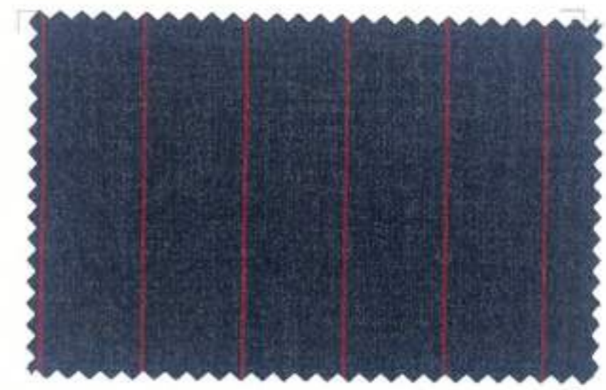
621 - 099 / 900 100% Wool 150cm 260g Charcoal / Red