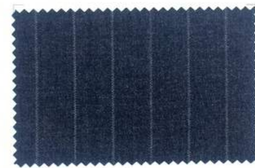
621 - 027 / 800 100% Wool 150cm 260g Charcoal