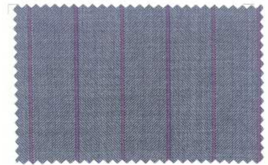
621 - 087 / 900 100% Wool 150cm 260g Grey / Pink