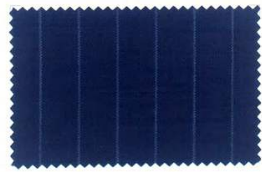
621 - 028 / 800 100% Wool 150cm 260g Blue