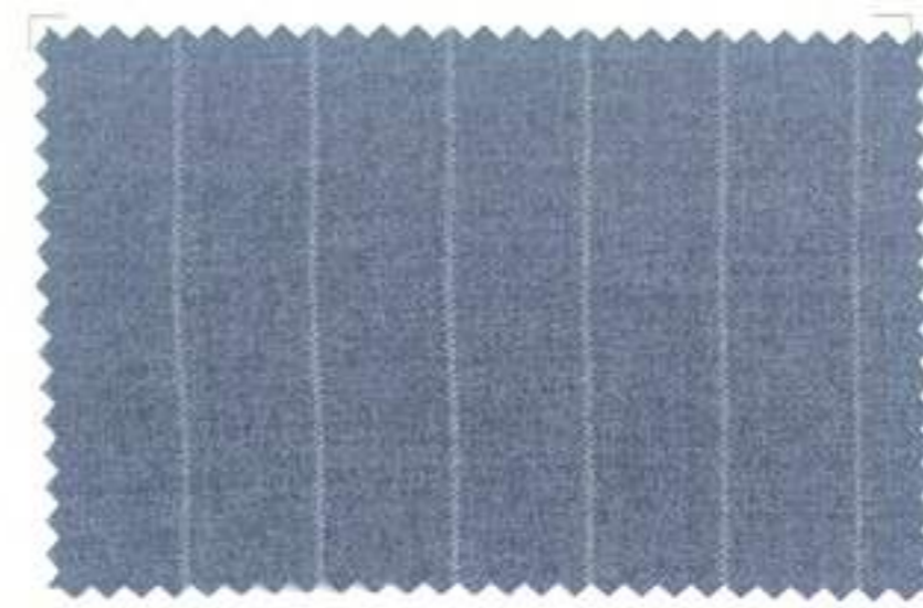
621 - 026 / 800 100% Wool 150cm 260g Grey